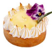
柚子蛋白霜撻 Yuzu Meringue Tart