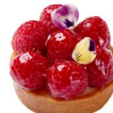
紅桑莓撻 Raspberry Tart