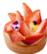
士多啤梨撻 Strawberry Tart