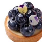
藍莓撻 Blueberry Tart