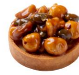
焦糖果仁撻 Caramel Mixed Nuts Tart