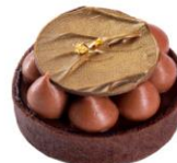
雙重朱古力撻 Double Chocolate Tart