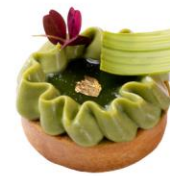
抹茶麻糬紅豆撻 Matcha Red Bean Mochi Tart