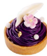
紫薯黑糖麻糬撻 Purple Sweet Potato with Brown Sugar Mochi Tart