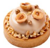
伯爵茶榛子撻 Earl Grey Hazelnut Tart