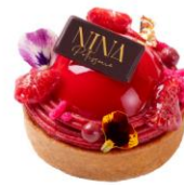
紅桑子開心果布丁撻 Raspberry Crème Brûlée Pistachio Tart